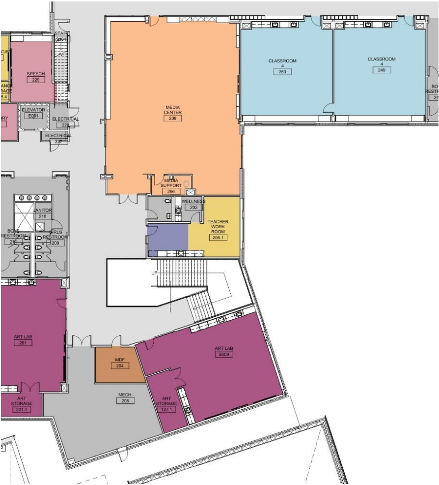
DD PROPOSED PARTIAL SECOND FLOOR PLAN