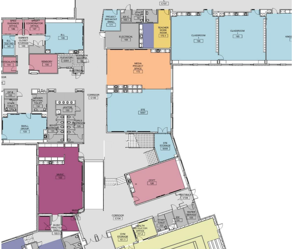
SD PARTIAL FIRST FLOOR PLAN